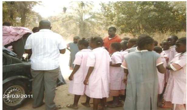
Children received uniforms donation

Hope Life International is active nationwide in numerous educational, humanitarian and social programs. Some highlights include long-term disaster relief and community, providing medical materials and rural schools, and the development of local language educational materials and training aids.