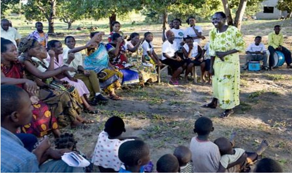
Community are sensitized on HIV/AIDS

Hope Life International has conducted several HIV/AIDS programs to create awareness in the community in the Gambia.