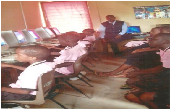
Children received donated computer training