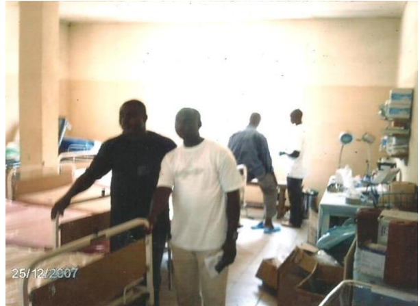
Lamin Clinic staff received hospital beds

Lamin Clinic was one of the luckiest to received 10 Hospital beds equipments for their health care delivering. Receiving donation the Director the Clinic was full of praises to have this opportunity and promised to use the equipment wisely.