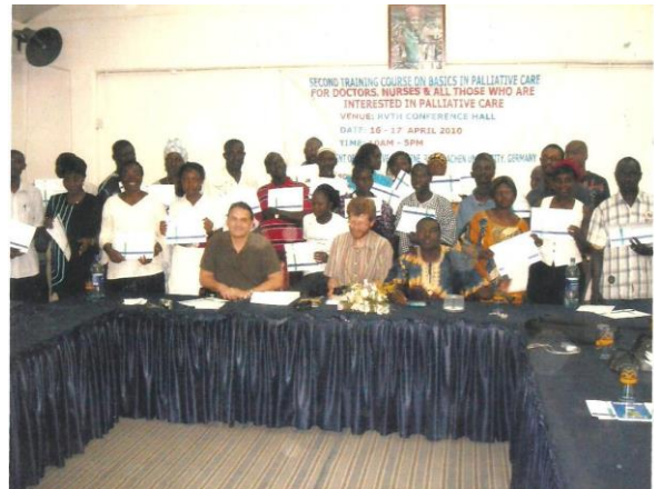
palliative care participant received certificate

Hope Life International (HLI), in collaboration with Hand On Care Brikama, Africa Palliative Care Association (APCA) and Foundation for Hospice and Sub-Saharan African (FHSSA) USA, held another important training workshop for physicians and other health care providers (e.g. nurses, laboratory and pharmacists) in pain assessment and management, with central focus on opioid use.