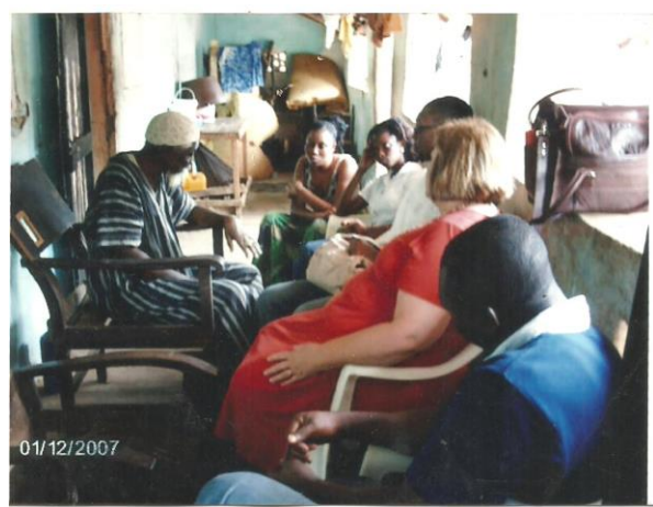
Home care team visit patient in the community