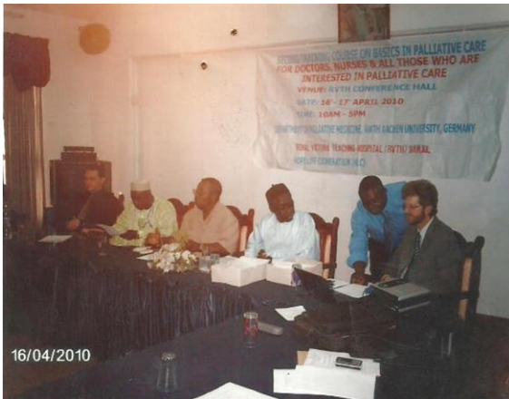
Pain management training workshop