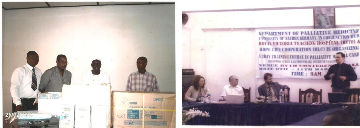
RVTH received donation