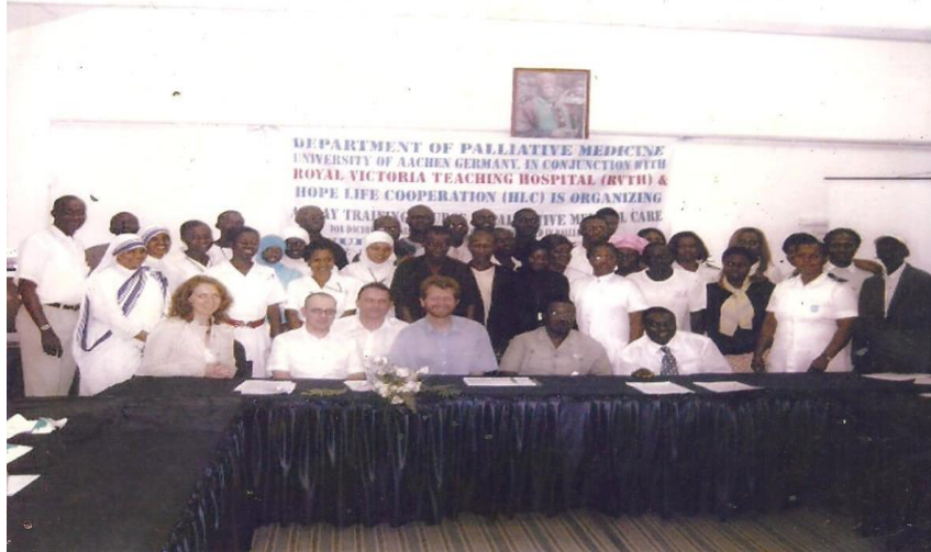
Picture show palliative care training participant

Due to the increasing cases of HIV/AIDS, Cancer, TB and other incurable illness that have killed so many people in the country with out proper care or lack of knowledge to care for the patients. Hope Life International charitable organization in collaboration with our partner University of Aachen, Germany, has for the first time conducted palliative care training workshop. The training focuses on physicians, nurses, social workers and all those that have sympathy for terminal ill patients in the country. The aim of this training was to create awareness and to equip the health professionals in the country for effective health care delivering. The workshop recorded total attendance of 45 participants from all the health care institutions that were invited.