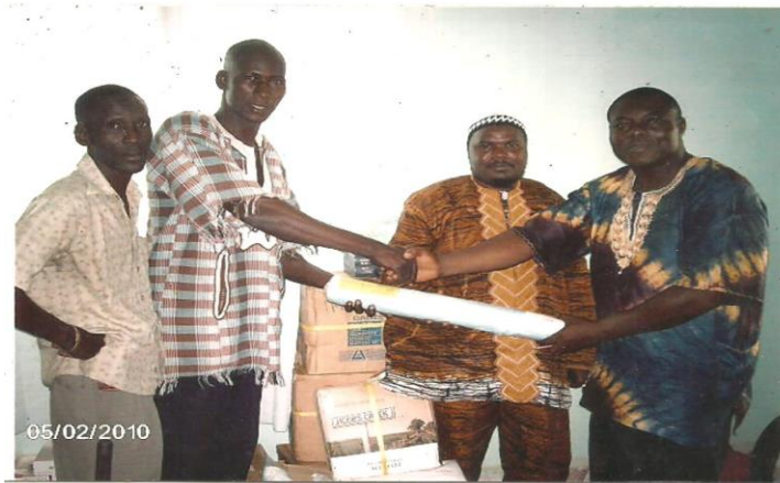
Jammeh foundation administrator received donation

Hope Life International (HLI)'s primary focus is to improve the health of less privileged ordinary people in the society and have donated hospital equipments to boost health delivery to Jammeh Foundation Hospital. The donation equipments have helped health care delivering in the community and administrator was happy to receive them.