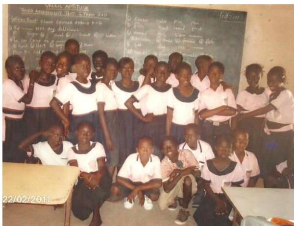
Pupils sanitized on malaria / HIV/AIDS